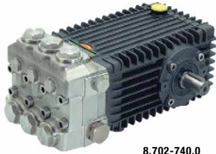
8.702-740.0 TSF Pumps