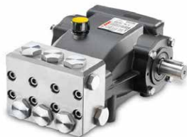
NMT ES Series