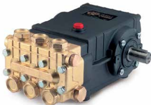
8.702-754.0 Solid-Shaft Car Wash Pumps