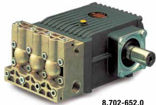
8.702-652.0 Large Frame, Solid-Shaft Pumps