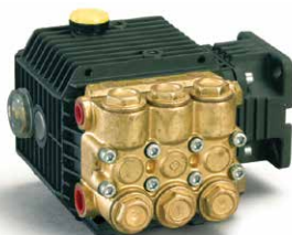
8.702-711.0 Gas Hollow-Shaft Direct-Drive Pumps