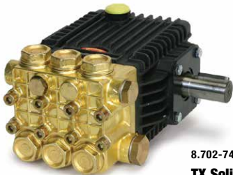
8.702-741.0 TX Solid-Shaft Pumps