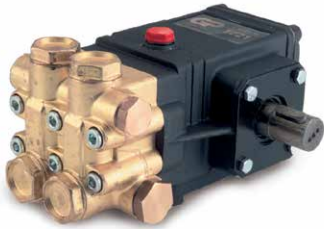
8.702-629.0 Solid-Shaft Pumps