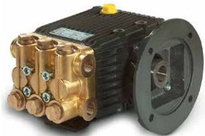
WJH-F and WJH