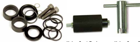
Piston Repair Kit Valve Seat Tools Valve Cage Tools